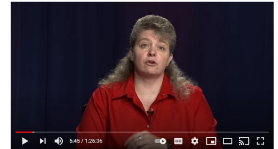
The Basics of the Fair Housing Act